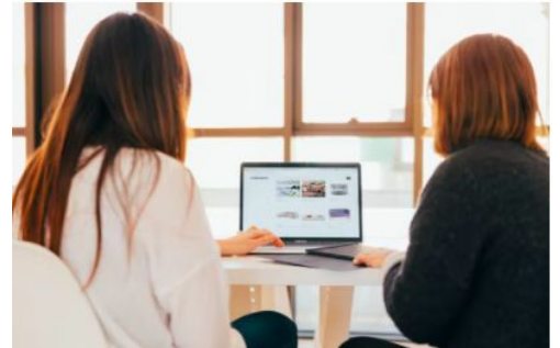
AT Service: Training how to use text-to-speech on laptop